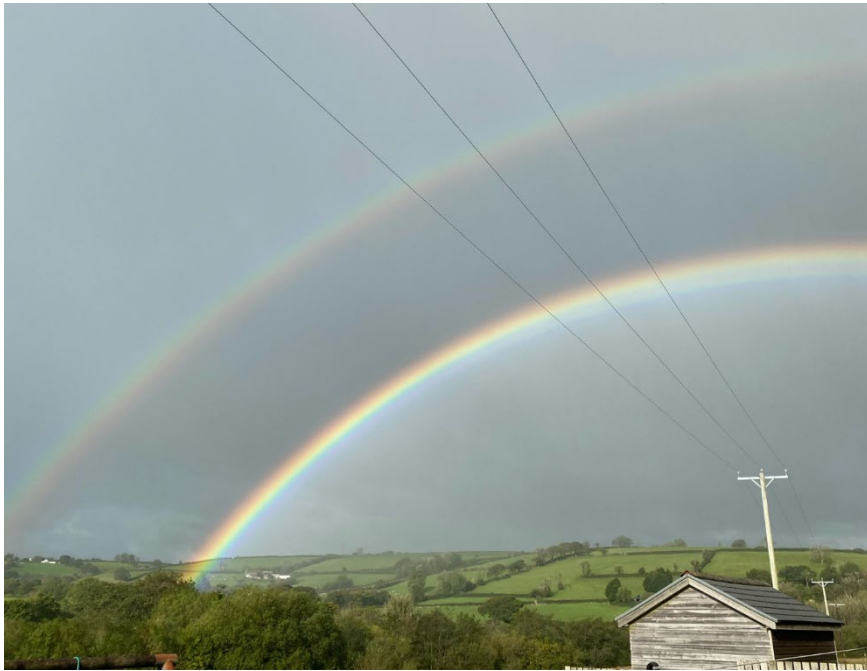
Double Rainbow over Llanpumsaint