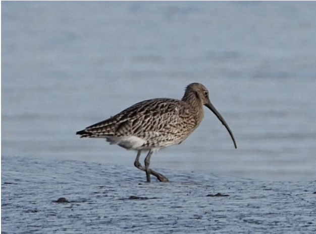
Curlew at Llansteffan