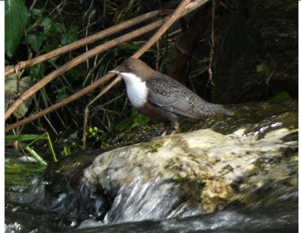
Dipper River Gwili (Clare Bishop)