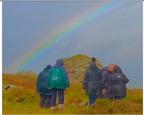
Dowers on the Preselis