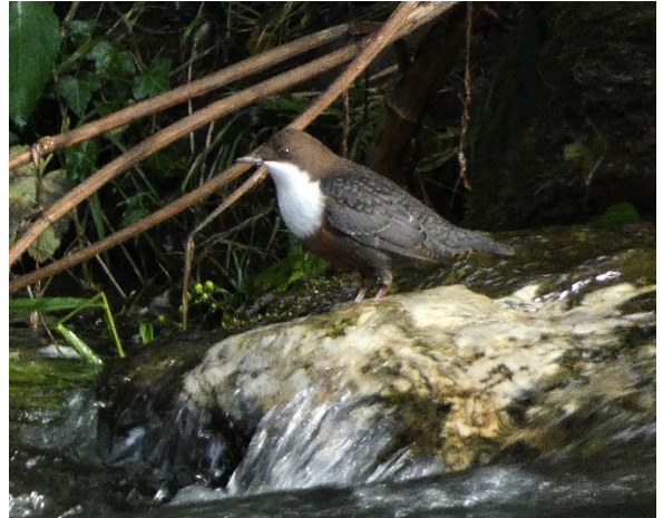
Dipper River Gwili (Clare Bishop)