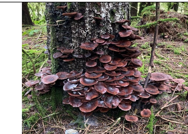
Good year for Fungi