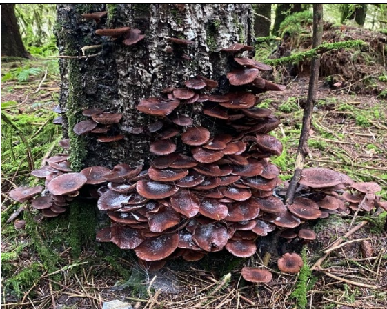
Good year for Fungi