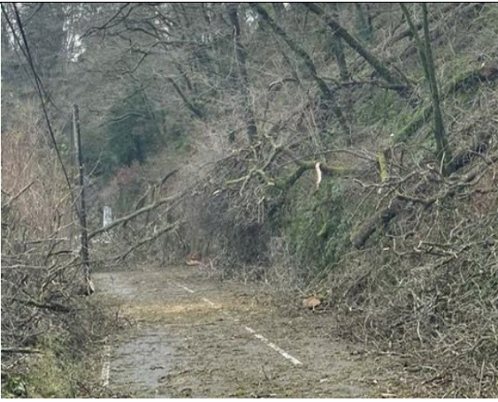
A484 Cywnyl Elfed 3/12/21