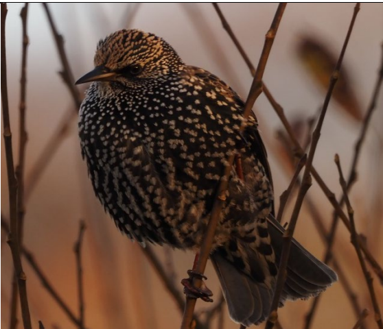
Beautiful Starling (Clare Bish)