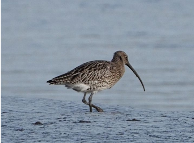
Curlew at Llansteffan (Clare Bish)